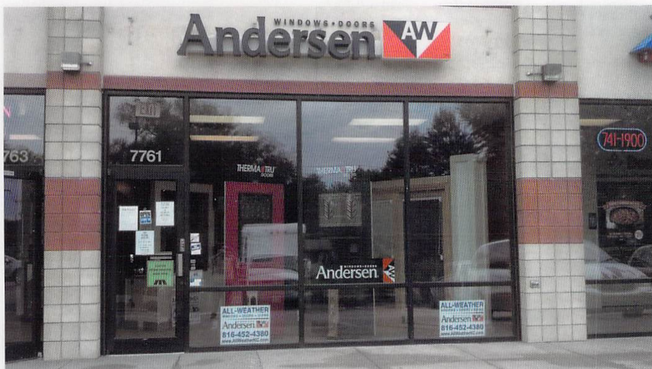
The storefront of All-Weather Window, Doors & Siding's Kansas City, Mo., location

Markets served: Single-family new construction, single-family remodeling, single-family replacement; multi-family replacement